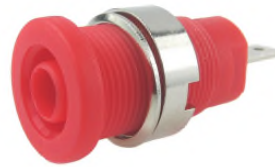
FCR73575R S16N/4.8 RED WNW