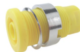
FCR7357Y S16N YELLOW WNW SOLDER TAG VERSION

Shrouded, 4mm, nickel or tin plated socket. Mates with shrouded or unshrouded plugs. Rated 1000V, CAT III. 24A for 4.8mm Faston and Solder tag 32A for 6.3mm Faston Supplied with M12 slotted ring nut and washer.