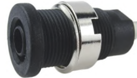
FCR7357B S16N BLACK WNW SOLDER TAG VERSION