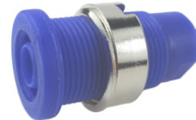
FCR7357L S16N BLUE WNW SOLDER TAG VERSION