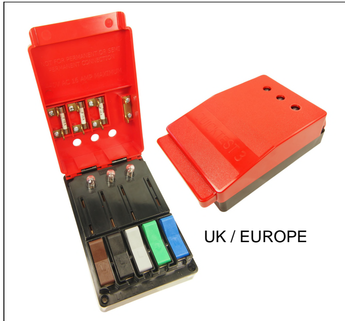
UK / EUROPE

Colour options available for region specific wiring codes. Custom colours also available on request.